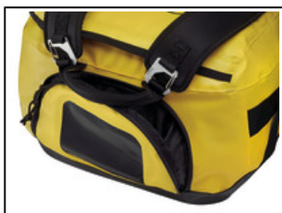
Large side pocket with zipper closure to separate the helmet, shoes or other objects from the rest of the equipment.