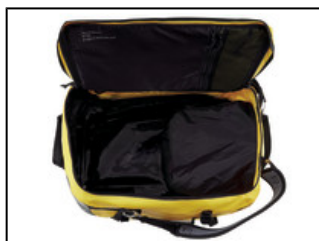
Large D-shaped opening for easy equipment organization

Designed to be carried in multiple ways, DUFFEL 65 is a convenient ergonomic bag with a volume of 65 liters. The back and shoulder straps are padded for comfort when used as a backpack. Versatile, it can be carried in multiple ways, thanks to the removable shoulder straps. It has a large opening which allows easy access to equipment, two pockets in the inner flap and a large side pocket for a helmet or shoes. A large transparent area allows rapid identification of the bag. It is constructed of high-strength TPU tarp fabric, for intensive use.