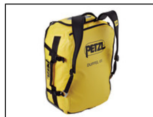
Padded, adjustable back and shoulder straps for comfortable carrying